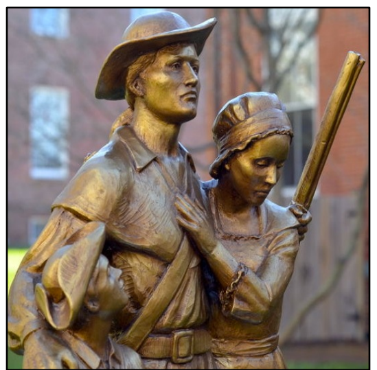
"The Spirit of Loudoun

This year, for our 8th annual Friends fundraising event to be held on Sunday, September 13, at Silverbrook Farm, we'll step back in time – to 1776 – to plumb our history and deepen our understanding of Loudoun County and its residents on the battlefront and home-