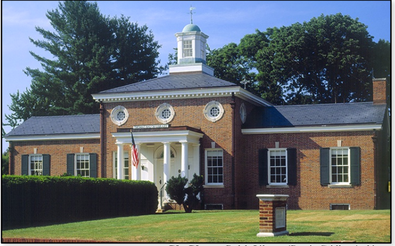
The Thomas Balch Library/Bowie Gridley Architects

It is, in effect, just another department of the Town. Because the Commonwealth of Virginia operates under what is called the Dillon Rule, the use of public money is prohibited unless expressly