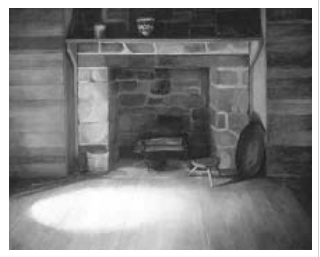
Slave cabin interior, Prestwould, Virginia

This moving exhibition consists of some of her recent works exploring and recording sites throughout Virginia and Maryland that played significant roles in the lives of African Americans during the time of slavery and after. One viewer's comment: "You take hard subjects, in the literal and figurative sense, and